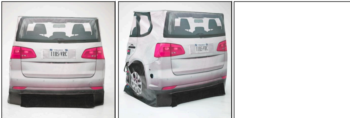
ADAC Advanced Emergency Braking System Stationary Target