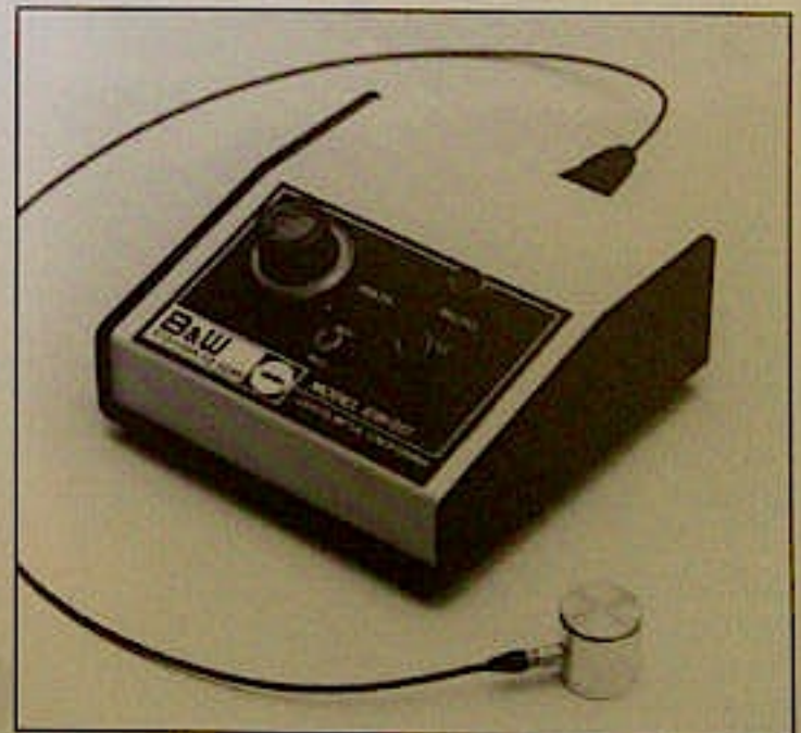
The Sensitivity Test Unit (STU) provides adjustable output to assist in sensitivity analysis.

The operator is required to monitor both the audio and visual displays. A fair degree of dexterity is also required to ensure proper placement of the DUT on the mounting surface. The operator's comfort should be considered when setting up the PIND station, particularly when the test is to be run on large lots or for extended periods of time.