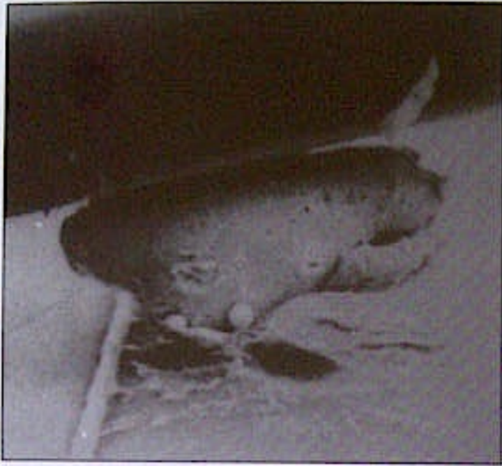
This particle caused a short circuit at a 1 mil wire bond

Any noise bursts as detected by any one of the three detection systems is cause for the device to be rejected. You may discover these defects visually as spikes on the oscilloscope, audibly as clicks or pops on the speaker, or by simply observing a lit threshold detector FAIL lamp. Although the FAIL lamp acts as the prime failure indicator, the other indicators provide useful evidence in failure analysis.